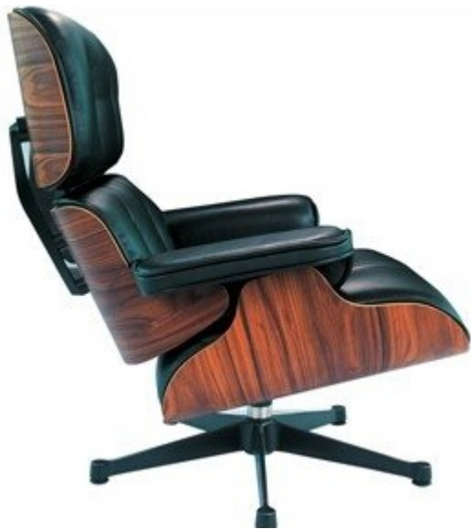
LOUNGE CHAIR BY CHARLES AND RAY EAMES - 1956

http://www.technologystudent.com/prddes1/eames1.html