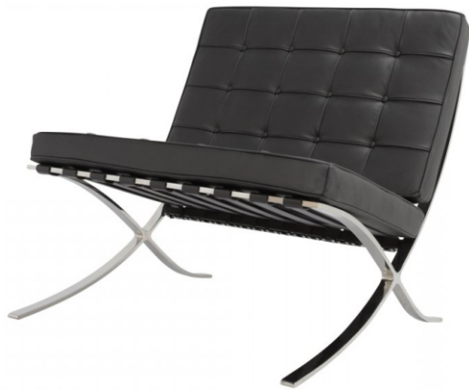
BARCELONA CHAIR 1929