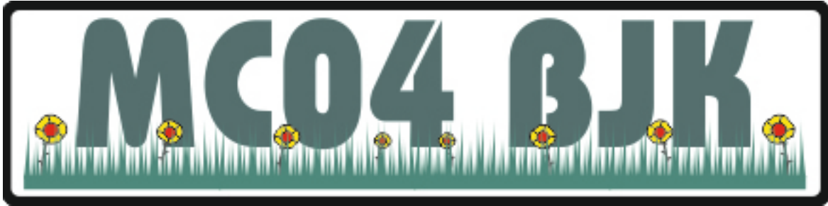
SAMPLE NUMBER PLATE

V.Ryan © 2012 World Association of Technology Teachers