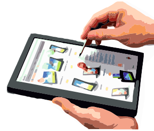
TOUCH SCREEN TABLET