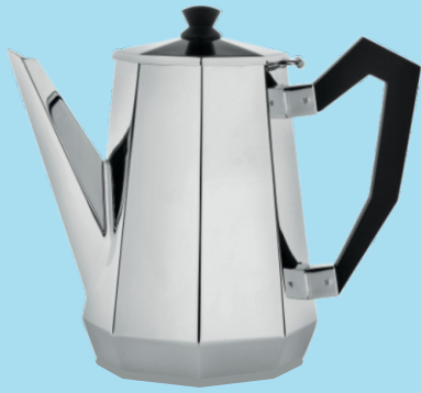
OTTAGONALE COFFEE POT, 1935 BY CARLO ALESSI