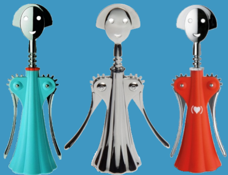
ANNA G. CORKSCREW 1994 BY ALESSANDRO MENDINI