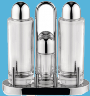
CONDIMENT SET, 1978 BY ETTORE SOTSASS