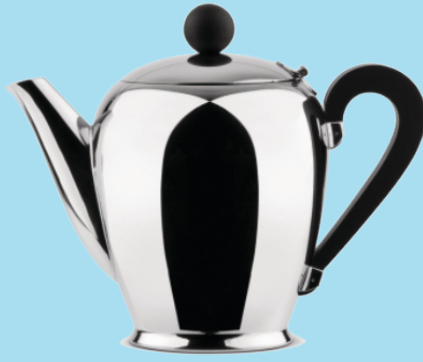
COFFEE POT BOMBÉ, 1945 BY CARLO ALESSI