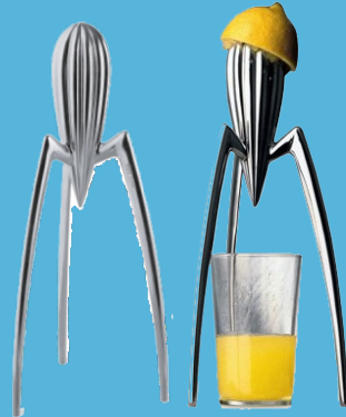
JUICY SALIF - CITRUS SQUEEZER 1990 BY PHILIPPE STARCK