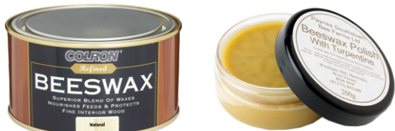
www.technologystudent.com © 2017

A first coat of wax is quickly rubbed into the surface, in a circular fashion. Use a clean cloth to remove surplus wax. Leave to dry over night and then apply another coat, following the grain. When dry, polish the surface with another soft cloth.