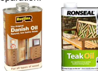
www.technologystudent.com © 2017

Danish oil is a mixture of thinned oil and varnish. The oil penetrates the wood fibres, whilst the varnish leaves a layer on the surface. It gives a natural glaze to wood and is a good choice for kitchen worktops or surfaces, being used for food preparation.