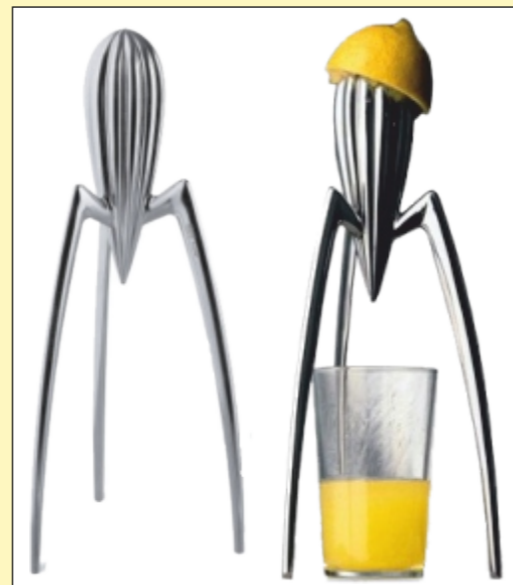
IMAGE / SKETCH OF THE PRODUCT

A piece of sculpture more than a functional object, as it does not have a base to collect the juice. This fact has not damaged its popularity and it is one of Starck's most recognisable designs. The Juicy Salif deserves to be the centre piece on the table, rather than storing it in a cupboard, waiting to be used.