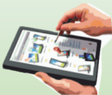
TOUCH SCREEN TABLET