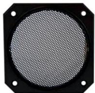
Two Speaker Grills