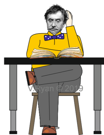
CHECKED FOR WORK WHILST BEING SEATED