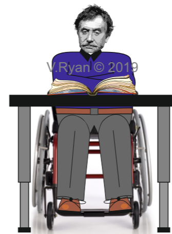
CHECKED FOR WHEELCHAIR USE