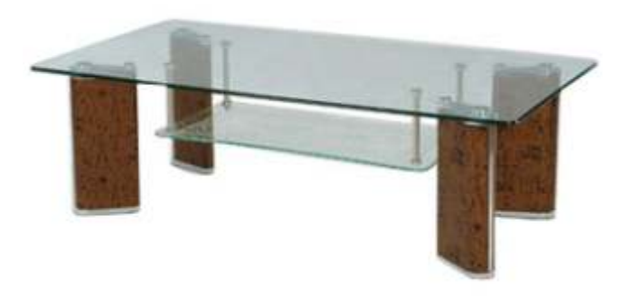
HEIGHT LENGTH WIDTH SIZE : 400mm X 600mm X 350mm