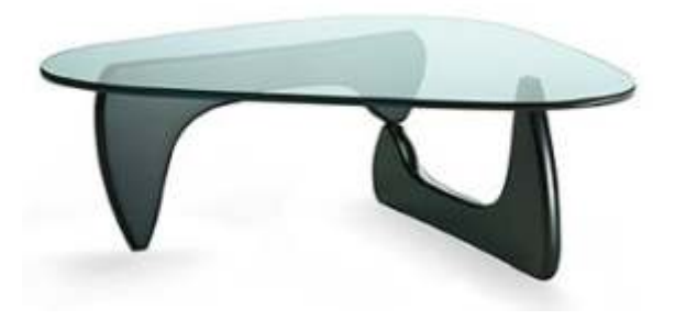
HEIGHT LENGTH WIDTH SIZE: 400mm X 580mm X 400mm