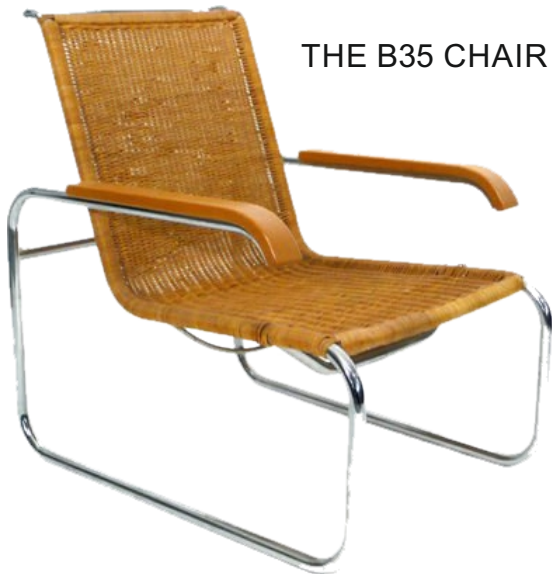
THE B35 CHAIR - 1928

3. Why can the chair be regarded as trend setting?