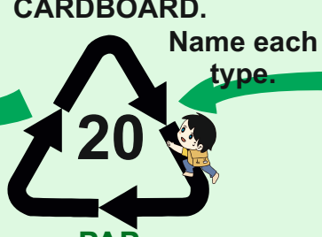
Cardboard including Corrugated

6. SKETCH THE VARIOUS FORMS OF CORRUGATED CARDBOARD.