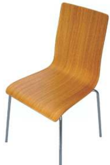
CONTEMPORARY WOOD/METAL CHAIR