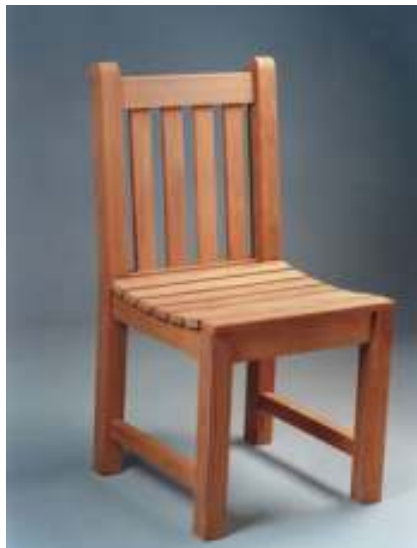
TRADITIONAL WOODEN CHAIR