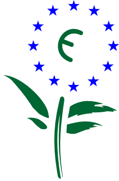
EUROPEAN UNION ECOLABEL

Design a symbol for the European Union, to encourage people to use sunflower oil in their cooking, rather than ordinary vegetable oil (which is less healthy). Companies that produce food products that include the ingredient sunflower oil, rather than less healthy oils, will be able to apply to use the symbol on their packaging. The symbol must have similar characteristics to the European Ecolabel (see the samples opposite).