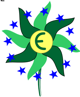
SUN FLOWER OIL SAMPLE DESIGN 2