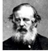
Abraham Darby 1st

Developed a technique of producing 'pig iron' in large quantities, through casting molten iron, crucial to the industrial revolution. He developed sand casting techniques, making it possible to produce cast products of a high standard.