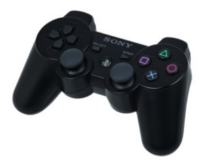
Sony Dualshock Wireless Controller