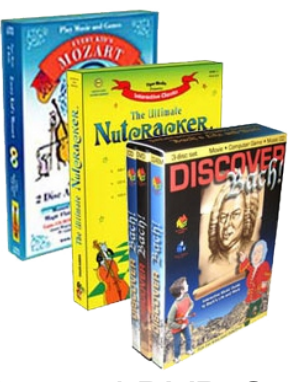
Several DVD Games