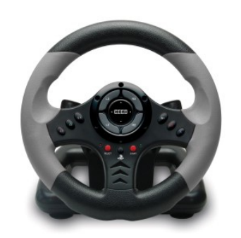
Racing Wheel Controller