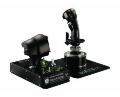
Warthog Flight System