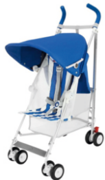
MACLAREN B-01 BUGGY