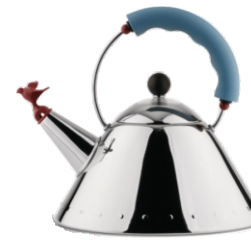
WHISTLING BIRD KETTLE