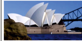
SYDNEY OPERA HOUSE