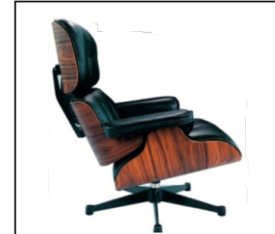
EAMES LOUNGE CHAIR

HAVE A LOOK AT THE ICONIC DESIGNS ON THIS POSTER AND SEARCH WWW.TECHNOLOGYSTUDENT.COM FOR MORE INFORMATION.