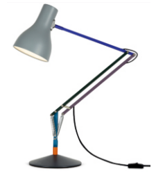
ANGLEPOISE® LAMP - 1932