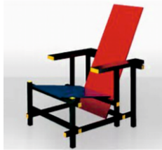
DE STIJL (NEOPLASTICISM)