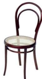
THONET NO 14 CHAIR