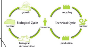
CRADLE TO CRADLE®