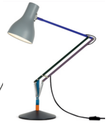
ANGLEPOISE® LAMP - 1932

WORLD ASSOCIATION OF TECHNOLOGY TEACHERS https://www.facebook.com/groups/254963448192823/ www.technologystudent.com © 2017 V.Ryan © 2017 RESEARCH EACH OF THE ICONIC DESIGNS AND WRITE FACTS ON THE REVISION WEB. ADD A SMALL IMAGE(S) FOR EACH OF THE WORDS/PHRASES. AN EXAMPLE HAS BEEN COMPLETED FOR YOU.