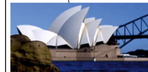
SYDNEY OPERA HOUSE