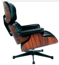
EAMES LOUNGE CHAIR