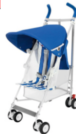
MACLAREN B-01 BUGGY