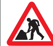
MEN AT WORK SYMBOL