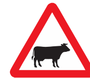
FARM ANIMALS SYMBOL