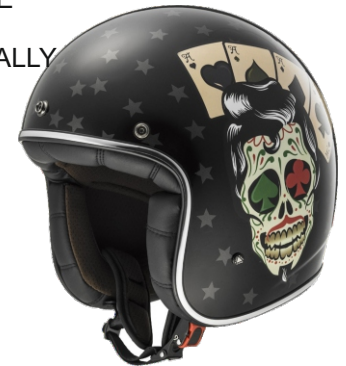
MOTOR CYCLE HELMET HYDROGRAPHICALLY PRINTED

A process whereby, a film of ink floats on the surface of water. A 'blank' product is immersed in the solution and collects the ink on its own surface. This allows complex and interesting patterns, to be transferred from the water, to the surface of a product. A range of materials can be used, including polymers.