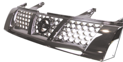
METALISED PLASTIC CAR FRONT GRILL

USE THE MOBILE APP SECTION OF www.technologystudent.com for all your Design and Technology