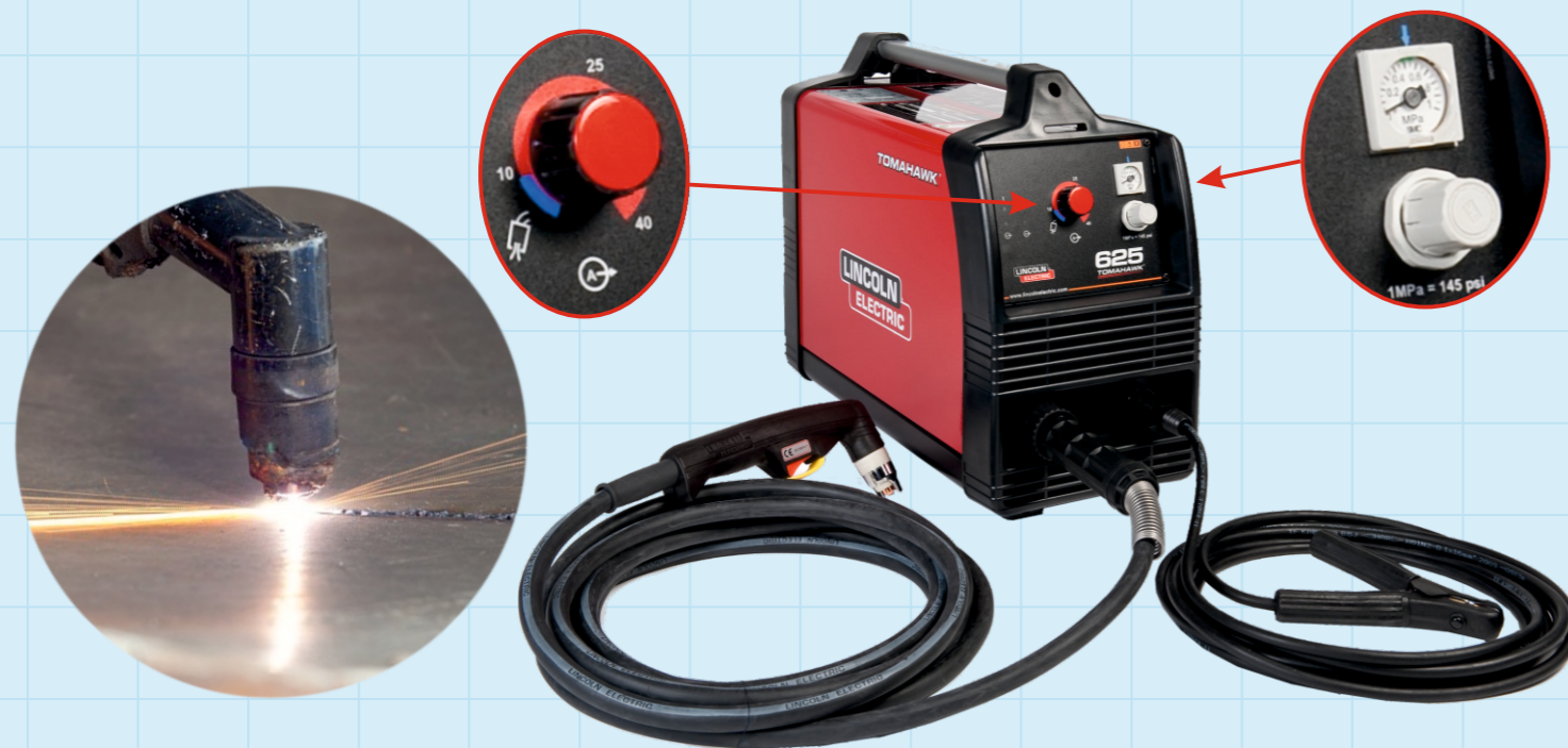
TYPICAL SMALL SCALE MOBILE PLASMA CUTTER