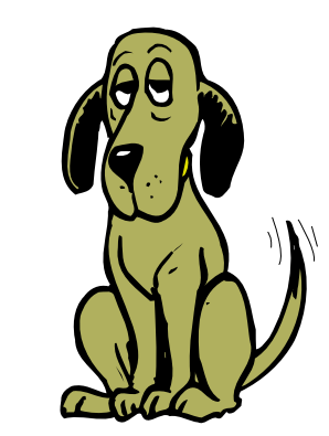
Jeff's dog is daft but loyal