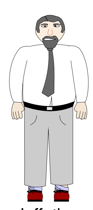
Jeff, the model citizen?