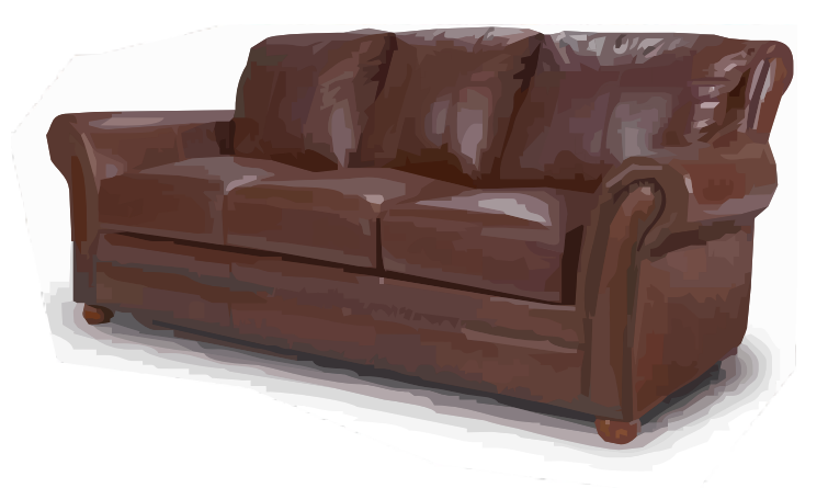
TRADITIONAL LEATHER SOFA